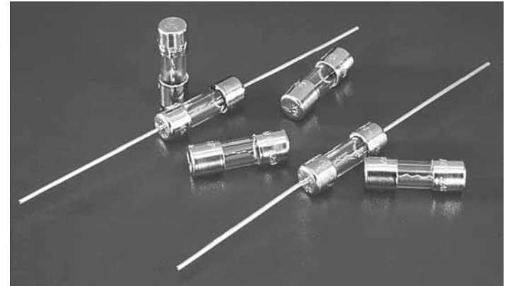
225 000 Series